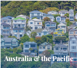
Australia & the Pacific