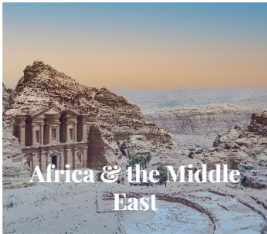
Africa & the Middle East