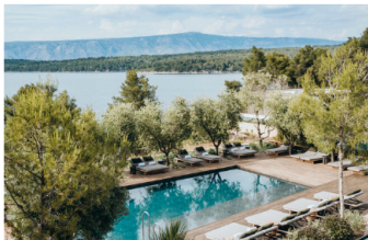
Variations on the Theme of Paradise Click here to read