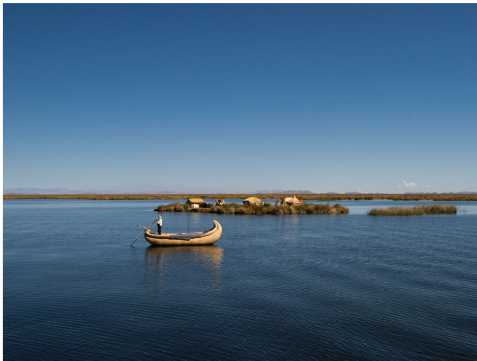
Titilaka, Puno, Peru

Eight destinations—found at the ends of the earth—take travel into a truly unprecedented dimension. Their isolated locales offer a unique perspective in space and time, all while offering deep immersions in restorative sleep, transcendent dining experiences, and once-in-a-lifetime activities.