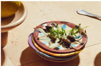
The Magic Formula for a Life Well Lived Click here to read